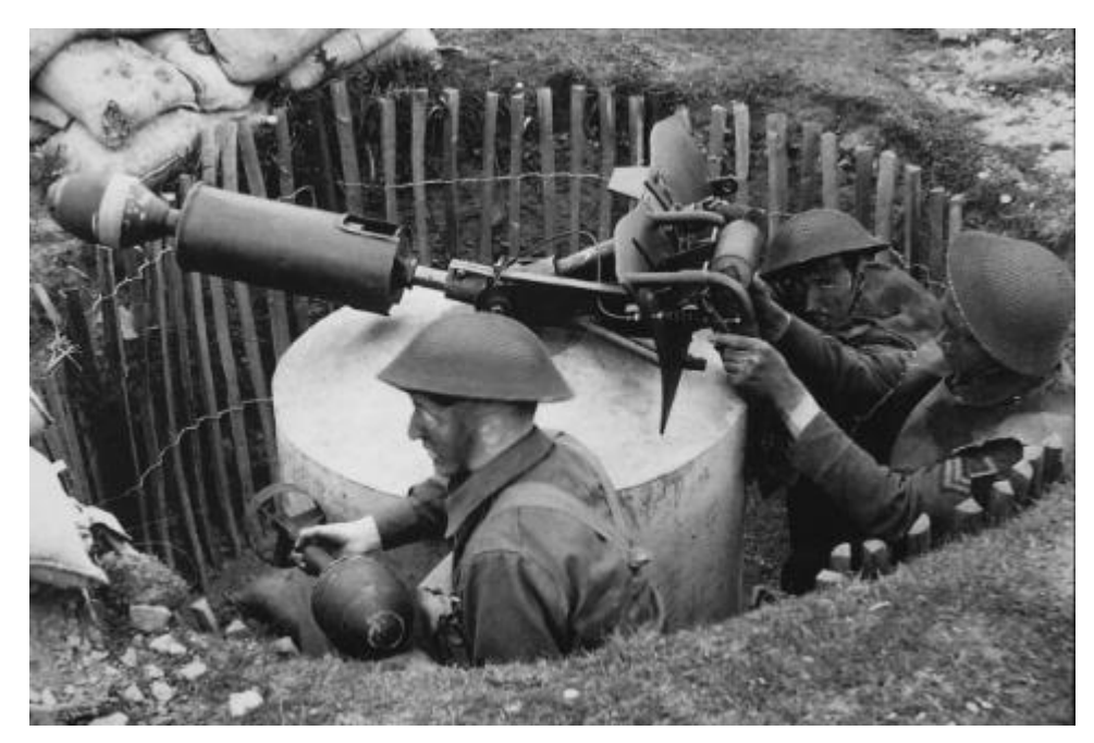
Photo showing Troops manning a firing pit. note how exposed they are.

The mortar was designed to stop tanks and if you look on the plan you will see that it is close to the road so I should think that they would only get one or two shots off before being in trouble.