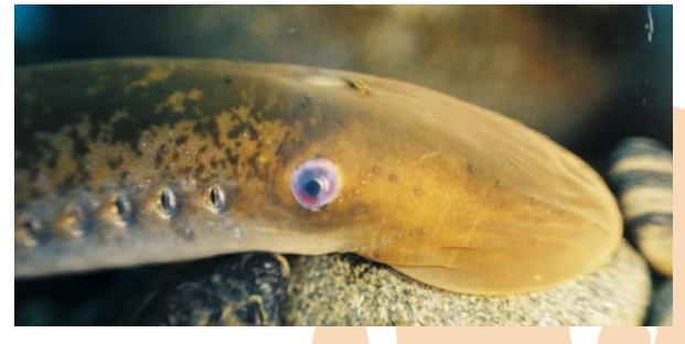
If you have information or pictures of fish spawning you would like to share, join the #spawningwatch conversation at https://twitter.com/EnvAgencyMids

If you watch the rivers carefully you may be able to see some fascinating spawning behaviour. Barbel and sea lamprey may still be spawning on gravel beds.