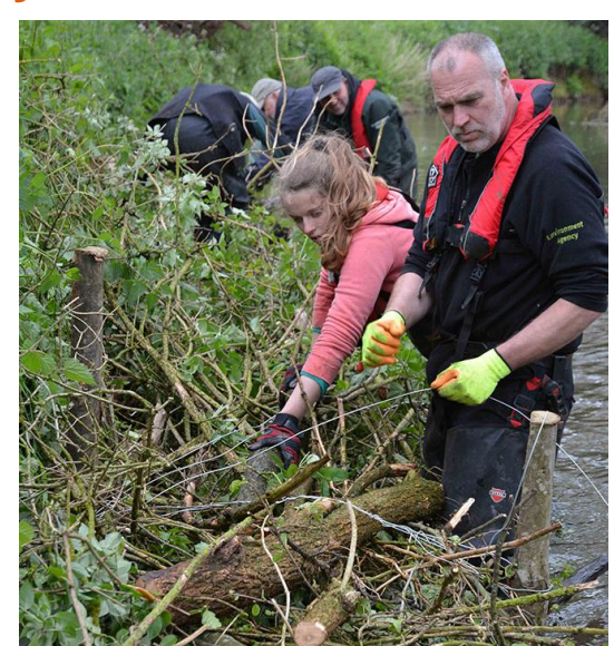
A Wild Trout Trust demonstration day.