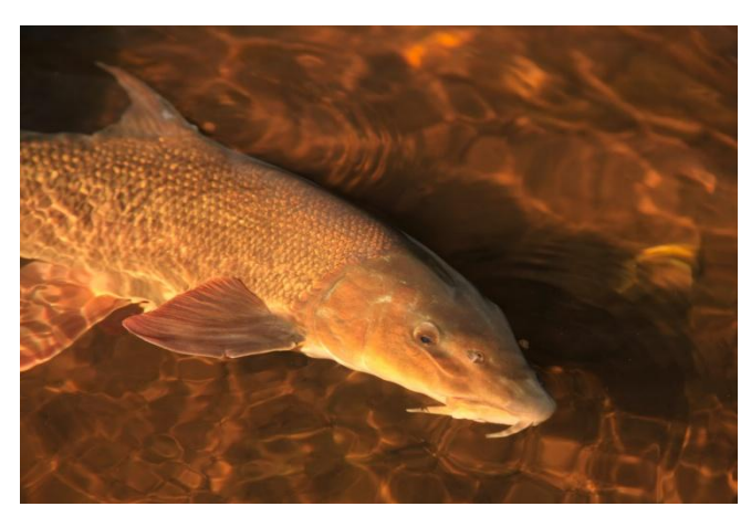
(Barbus barbus) the pig fish