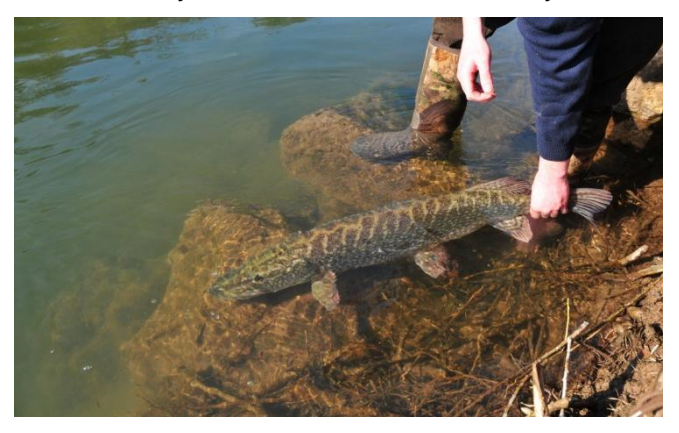
Find your local fisheries at: www.fishinginfo.co.uk