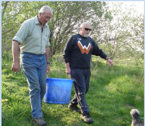
Fisheries team moving fish to Pool 4