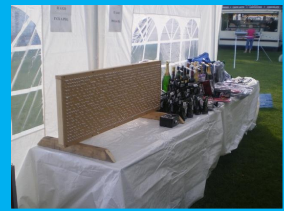
Pick a peg - £1 a go!